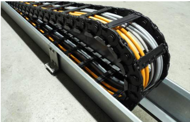
E-200 System PKK chain with guide trough.