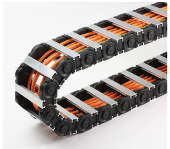
PLE with aluminium stay bars suitable for heavy duty applications.