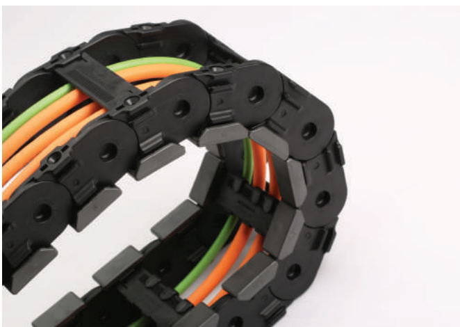
E-200 System PKK chain with low friction sliding pads.